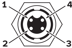
Female Connector (Device)

The calibration certificate for the device should be used as the definitive reference for custom wiring options.