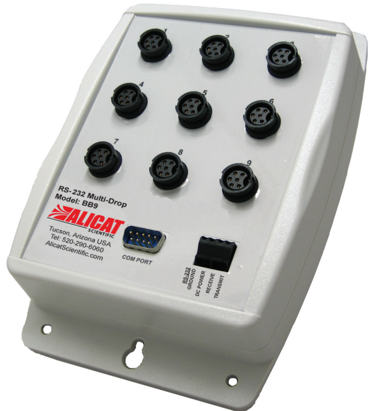
6 pin Locking Industrial Connector