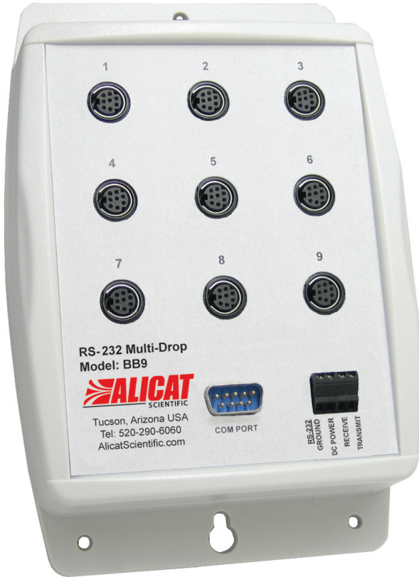
Standard 8 pin Mini-DIN Connector